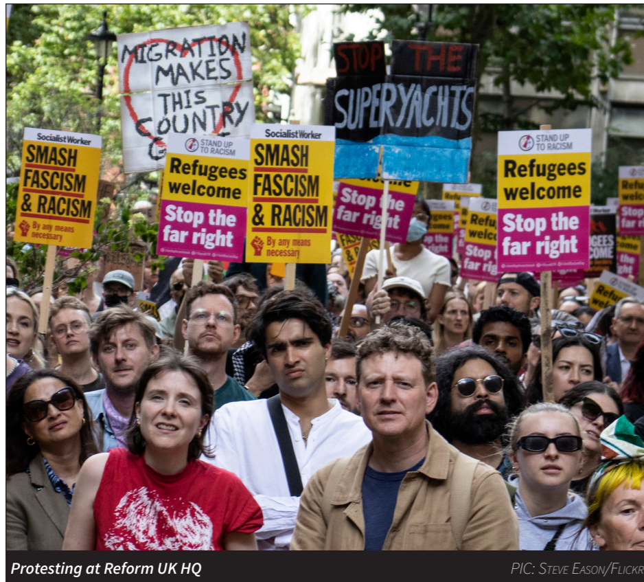
Protesting at Reform UK HQ